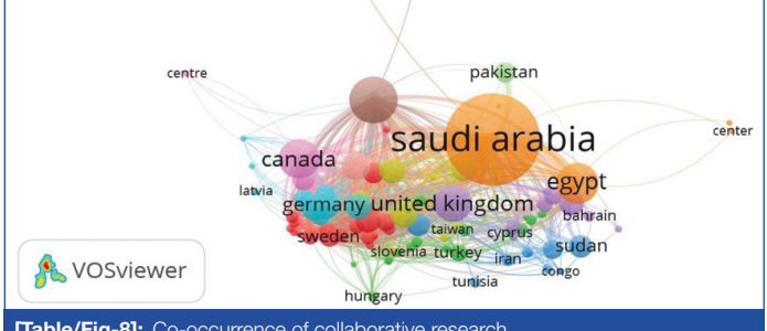
[Table/Fig-8]: Co-occurrence of collaborative research.